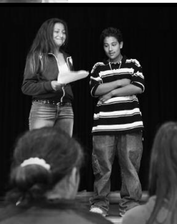
PPF's Youth Leadership Team builds the advocacy skills of youth concerned with violence in their community.

L ocated in south San Diego County, National City has the highest violent crime rate in the county, much of it drug-related. It is estimated that 12 gangs operate in this area, and more than 500 young people under 25 years of age have been identified as gang members. It is the second poorest city in the state, and the local high school has the highest dropout rate in its district.