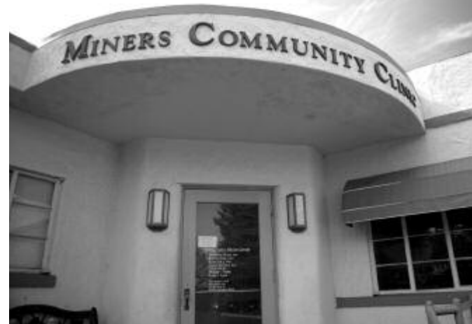
As an FQHC, Miners Family Health Center provides a wider scope of care and operates on a stronger financial footing.