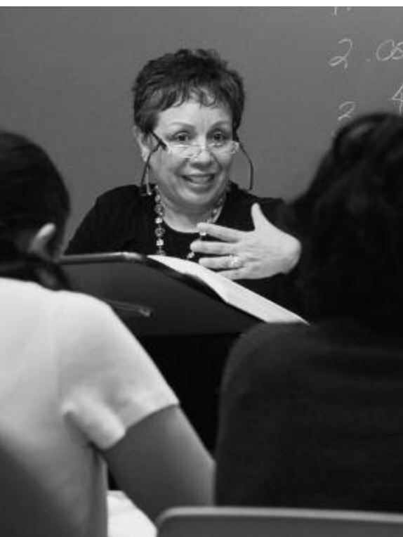
Mount St. Mary's College in Los Angeles was one of the nursing programs studied by TRPI.

The results of TRPI's findings will be disseminated in a report to policymakers and stakeholders throughout the state this summer at two regional briefings. TRPI also plans to post the report online, issue a news release, and also announce its release on a widely circulated electronic mailing list.